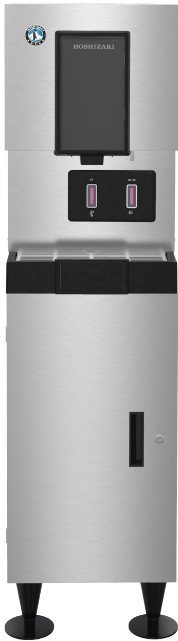
Freestanding Model Use SD-271 stand. (not included)

Attractive, stainless steel modern design delivers a great ice experience with easy-to-chew cubelets and touchless operation.