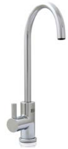
Round Slimline single levered dispenser